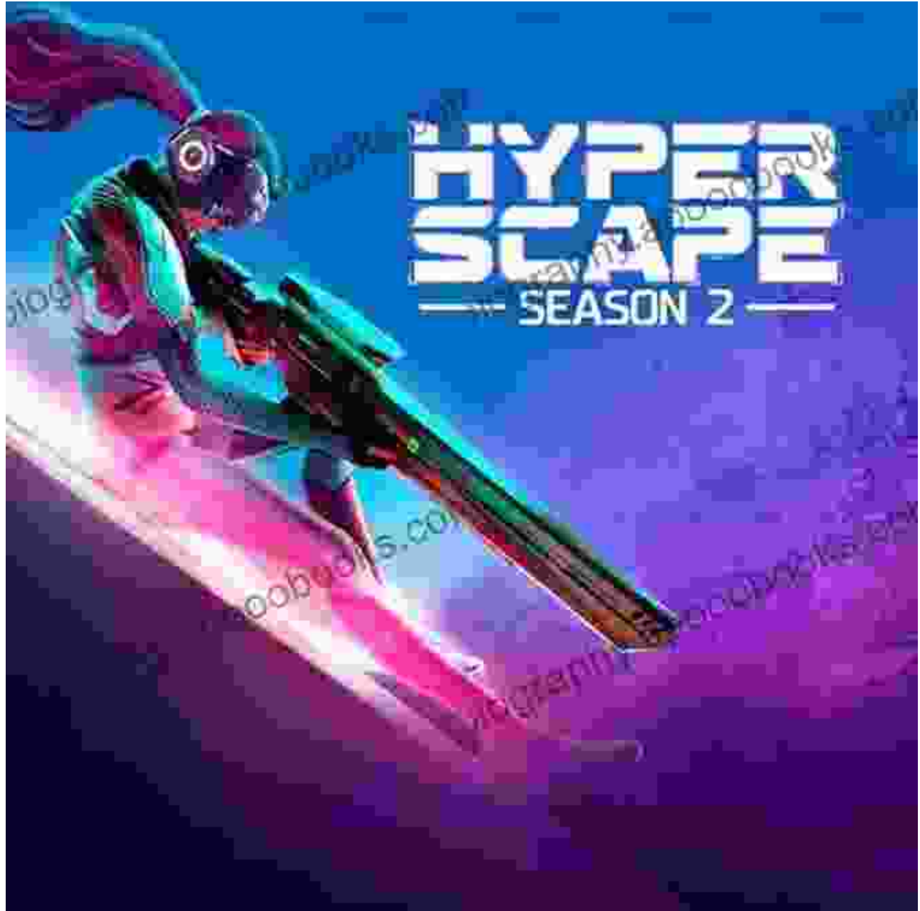
Cover of Hyper Scape Part Two

Embark on this enlightening journey into the depths of time, consciousness, and existence. Free Download your copy of Hyper Scape Part Two today and unlock the mysteries that lie within.