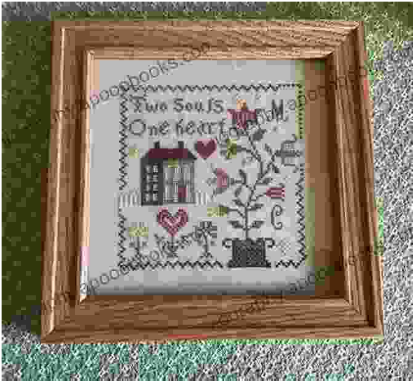
Framed cross stitch artwork adds a touch of elegance to any room.