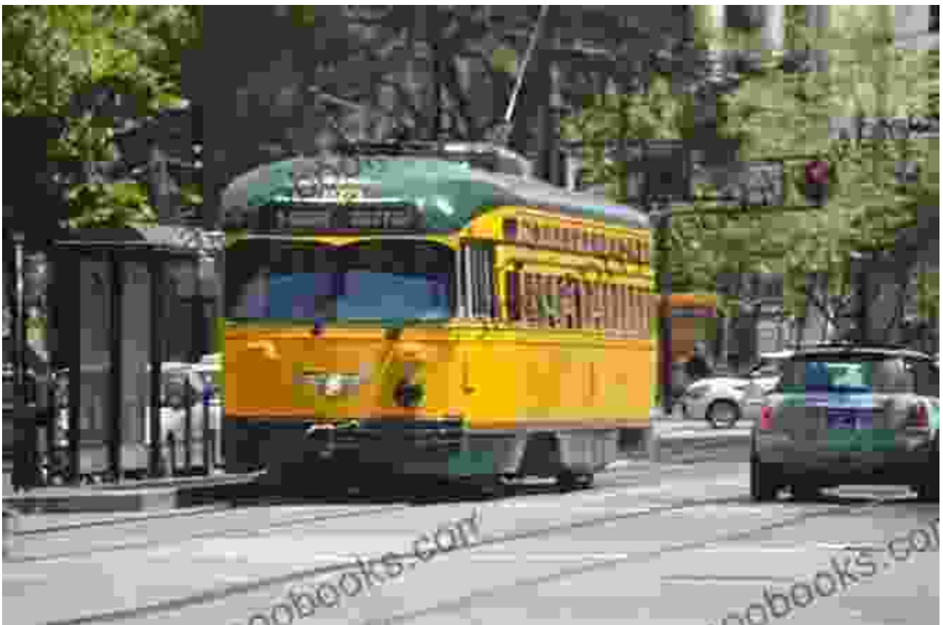
A 1920s-era San Francisco tram, a vital part of the city's public transportation system during the Golden Age of Transport

Tram networks expanded rapidly, connecting suburbs to city centers and providing affordable transportation for workers and residents alike. Trams became an integral part of the urban landscape, shaping the development of cities and the daily lives of their inhabitants.